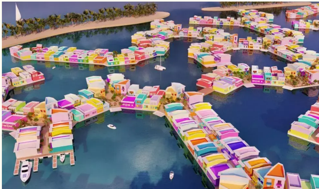
Maldives Floating City is the first development with resilient eco-friendly floating projects.

Imagine your own aquatic home that can dock or float freely. It's already being built as part of the Maldives Floating City. Unbothered by sea-level surges, these homes will anchor in Venice-like villages, with canals instead of roads, in a car-free city for thousands. What's more, each pod is engineered to stimulate coral growth beneath the surface, nurturing a healthier water world.