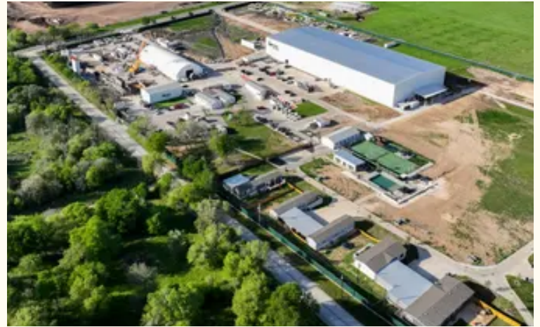
Elon Musk plans to build a company town outside of Austin, Texas, and envisions a "utopia along the Colorado River"

What goes around comes back with a twist: Today we have Google's Bay View, 42 acres in Mountain View which will be home to 4,000 ad-products workers. TikTok mega-star MrBeast bought up a North Carolina neighborhood for his staff to live closely, comfortably, and affordably in an era of hyper-high housing costs.