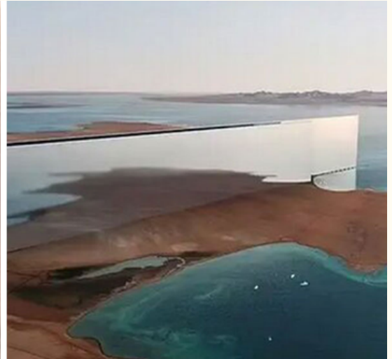
The Line, linear smart city under construction in Saudi Arabia, which is designed to have no cars, streets or carbon emissions.